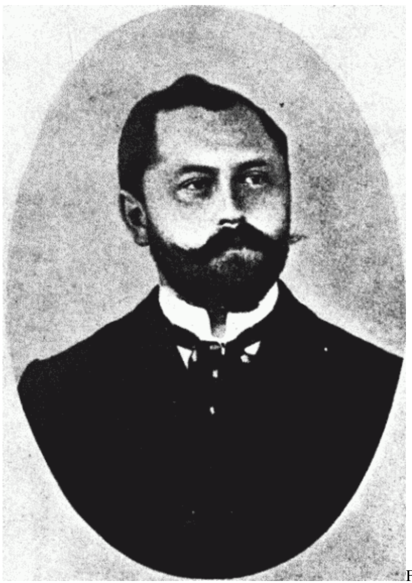
Fritz Schaudinn [1871-

[10] The control of infectiousness in syphilis through treatment is considered in the next chapter.